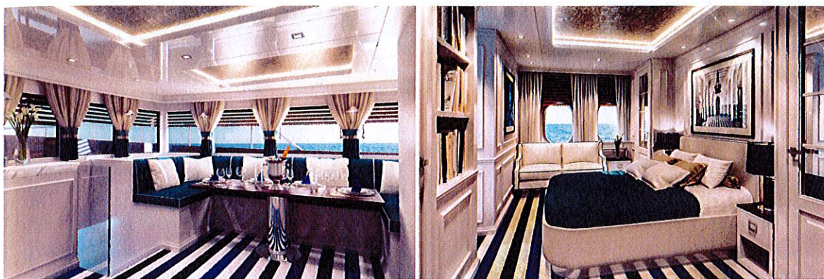
Striking signals: Luca Dini's suggestions for the Italian-style interior are based on sharp contrasts, as here in the saloon on the main deck (left) and below in the owner's suite. It is anticipated that a buyer of the Kitalpha 22 might wear white shirts on board and arrive by Tesla.

can only be experienced in remote stretches of water, gently motoring into the mouth of a quiet river perhaps. "Looking back" is how you could describe this design. Or even as "Gentlemen only".